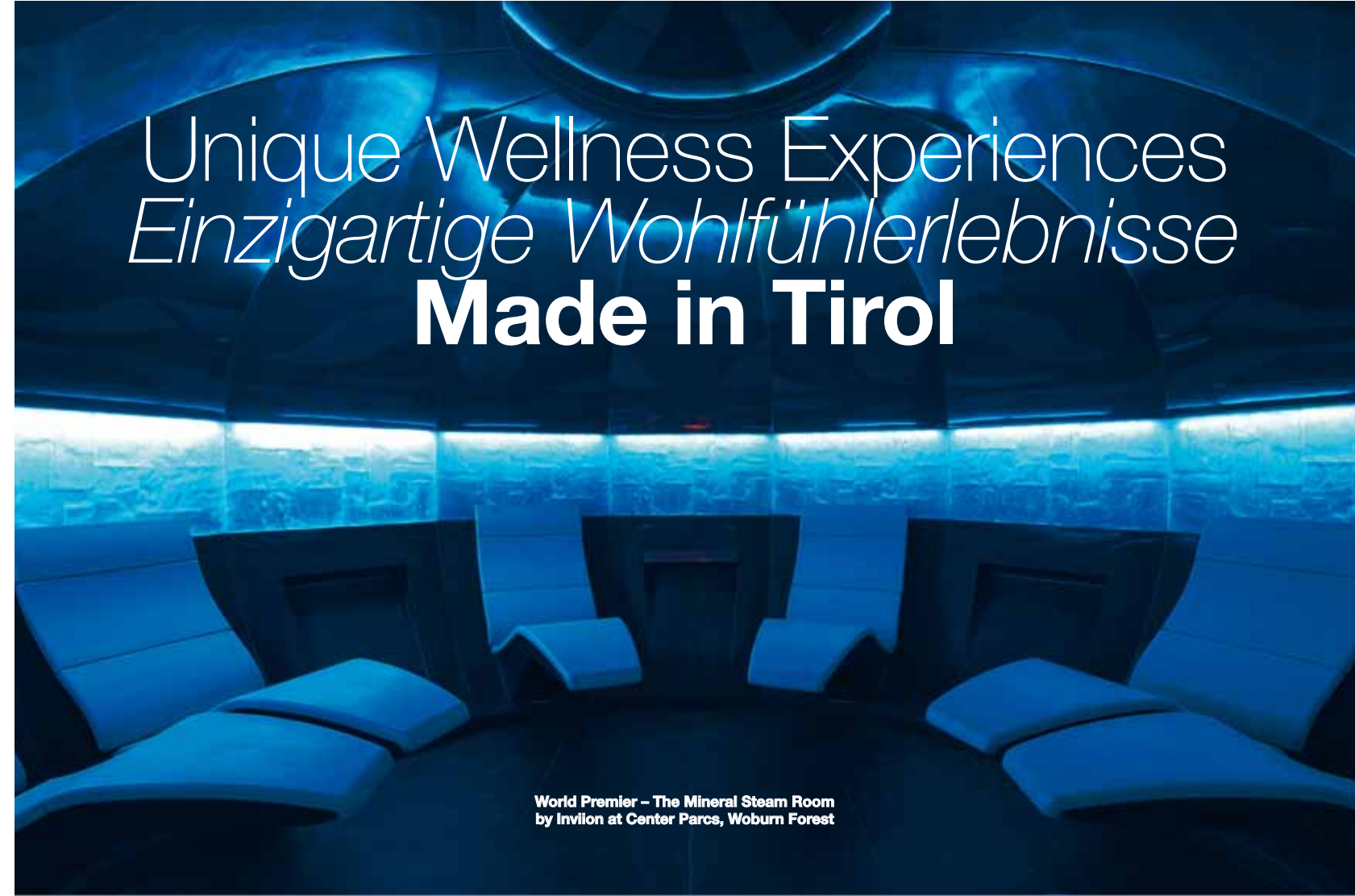
World Premier – The Mineral Steam Room by Inviion at Center Parcs, Woburn Forest

[Fun, SPA and wellness] client Credit Suisse Anlagestiftung Real Estate Switzerland, Zürich architects Suisse Projets - Development Design and Finance DDF Group Architekten floor space / volume 12 500 m 2 / 90 000 m 3 program recreation and relaxation: 8 000 SPA and wellness areas: 2 500 fun: 2 000 water surface: 1 400 water attractions: 200 continuous meter slides: 750 Span of the dome: 70 Poolside bar and 2 panoramic wave pool Outdoor iodine sauna Light concept date / cost 2013 / 90.000.000 Chf general contractor Garzoni SA waterproofing industrial floors / roof Spalu SA coating domes Canobbio Textile Engineering srl innovative Spa equipment Inviion take self service Franco dell'Oro SA SPA design and solution Schletterer GmbH